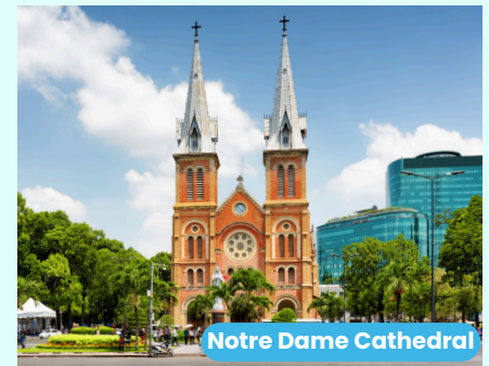
Notre Dame Cathedral