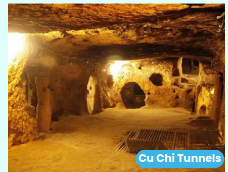
Cu Chi Tunnels