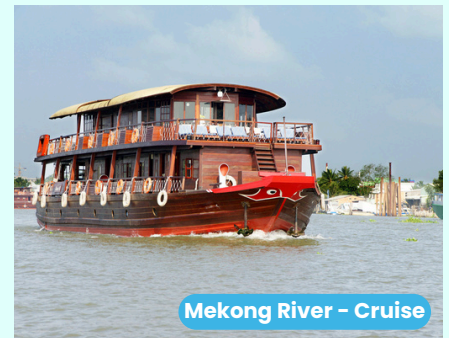
Mekong River - Cruise