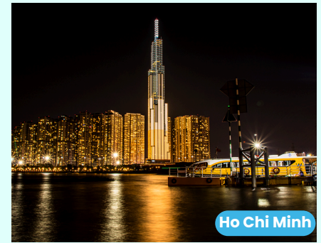
Ho Chi Minh