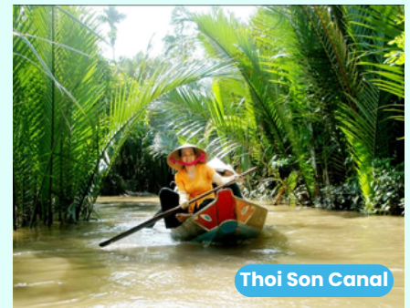
Thoi Son Canal