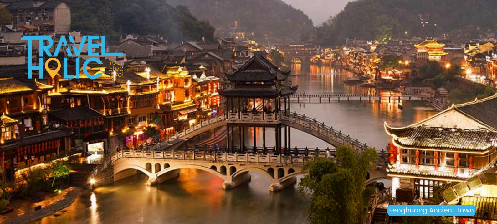
Fenghuang Ancient Town