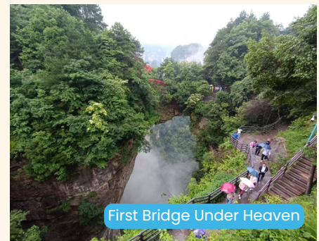
First Bridge Under Heaven