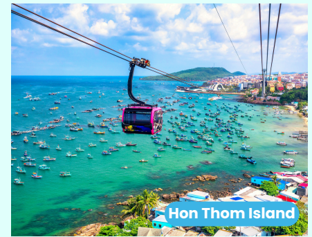
Hon Thom Island