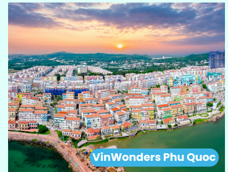
VinWonders Phu Quoc